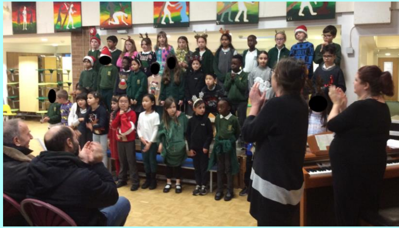
Choir Performance for Families