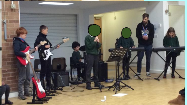
iRock Performance Families