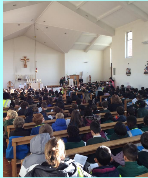
Advent Service in St Anthony's celebrating diversity, peace, love, hope and joy!