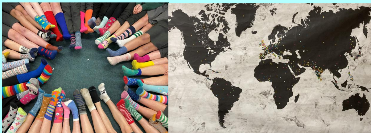
Odd Socks Day and Our Map showing the numerous connections we have with the world!

The diversity in our school is something we celebrate – both with our international day and our PTA international evening. Both incredibly successful events recognising our connections all over the world! This was built on a few weeks later in anti-bully week and odd socks day – again recognising that we are all unique and special.