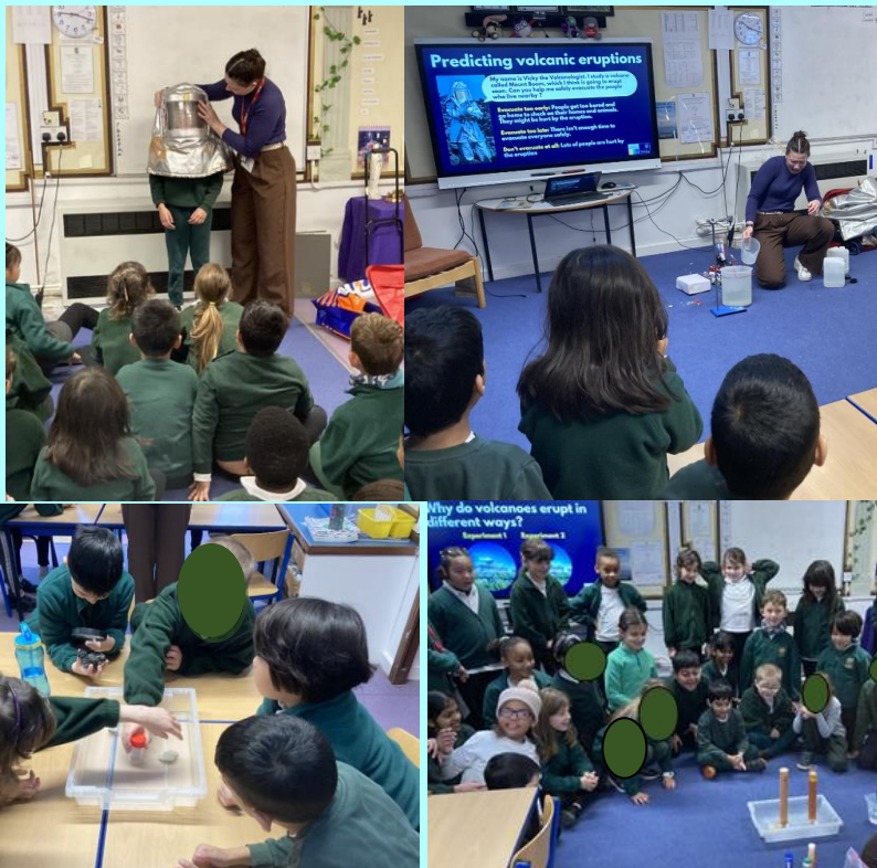
Science Visitors to Year 3 and Year 5!

We received lovely feedback from the visiting Scientist: