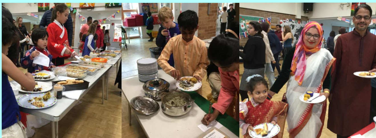
PTA International Evening was a huge, delicious success!